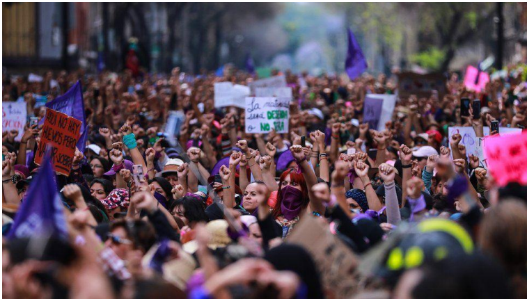
Figure 2 : Mexicans protesting against gender-based violence in 2020

As mentioned before, violence against women is frequent in Mexico. In order for the citizens to raise awareness for the problem, multiple protests occurred in Mexico City (the state's capital) . Those protests aimed to the remembrance of the victims of femicides and the expression of discontent and anger regarding the absence of reaction by the government. Many were the occasions when the protesters had to face law enforcement officers that used violence in order to control the crowd. In any case, the protests were a collective response to the apathy of the government concerning the issue and the tolerance of such cruel gender based acts.