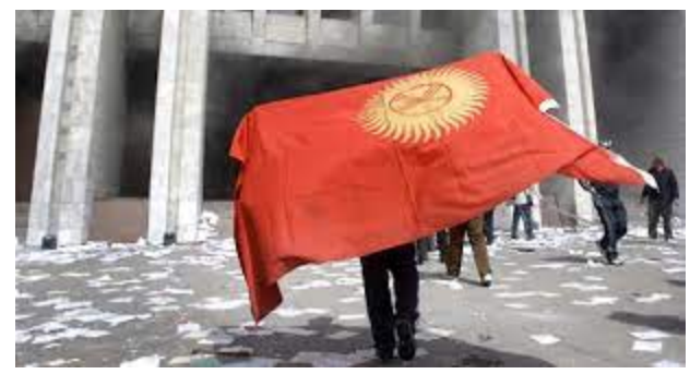
Figure 5: Protester in the Tulip revolution waving the Kyrgyz flag <sup>11</sup>

This led to a giant power-struggle in the nation, in which multiple factions participated, of which most were associated with organized crime. From that point on, it was all downhill. Political instability was a constant and government corruption was a certainty. Protest after protest, assassination after assassination the nation was falling. Not 5 years later, there was massive civil unrest in 2010 due to some new government measures that were implemented in order to benefit it instead of the people.