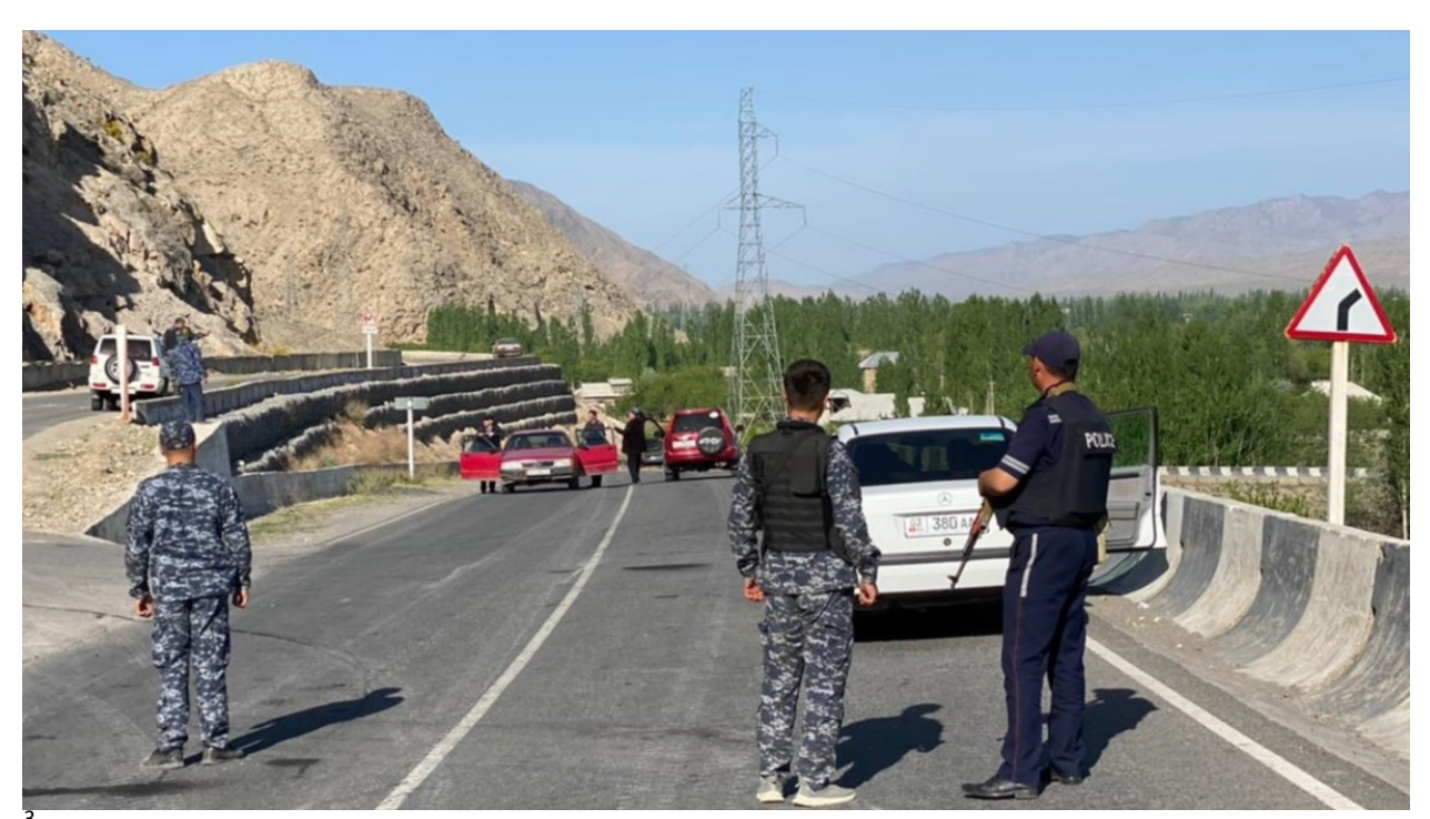
Figure 2: A picture of the Kyrgyz-Tajik border

A political boundary is an imaginary line separating one political unit, such as a country or state, from another. Sometimes these align with a natural geographic feature like a river to form a border or barrier between nations. Occasionally, two countries may contest where a particular border is drawn.<sup>2</sup>