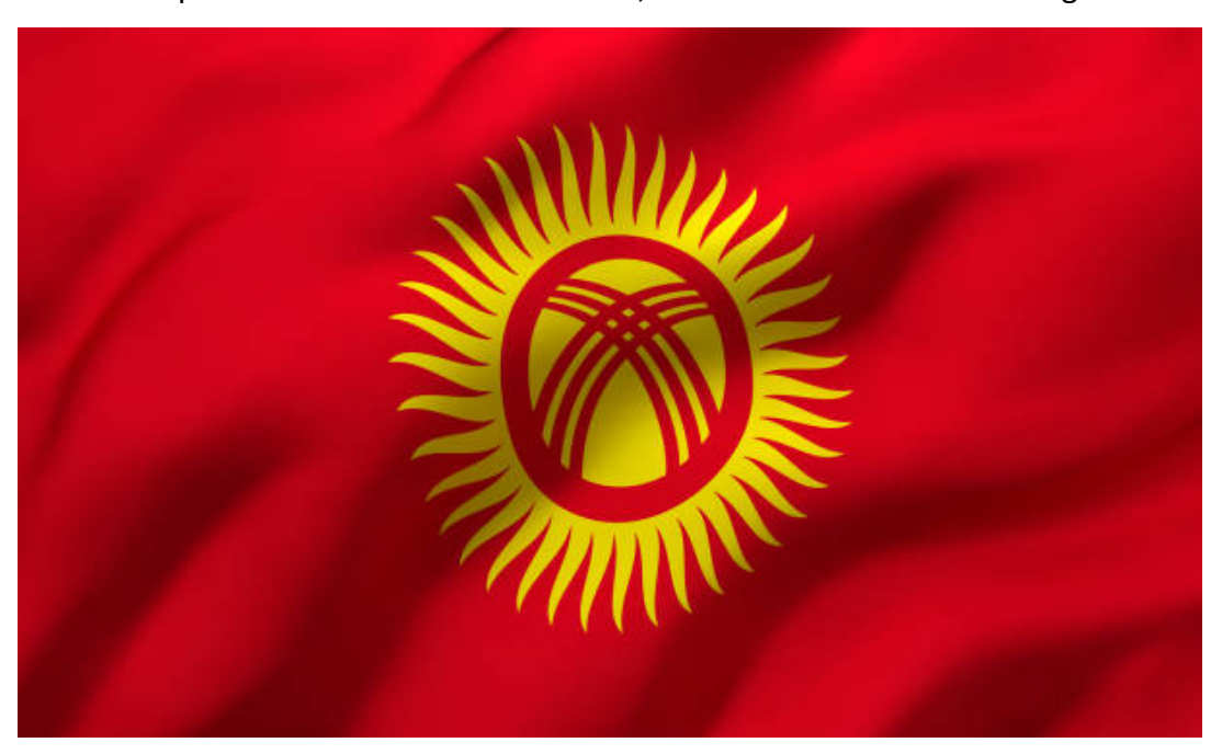
Figure 4: The national flag of Kyrgyzstan adopted in 1992 is now a symbol of peace and indendence <sup>10</sup>

As soon as independence was established, the nation was in need of solid leadership and so in need of elections. The elections took place in October of the very same year, in which — not surprisingly — Akayev ran unopposed, receiving a staggering 95% of the votes cast. Kyrgyzstan, after joining the Commonwealth of Independent States, gained full independence and autonomy on the 25<sup>th</sup> of December 1991. Once again, it comes with no surprise that around the same time, the USSR was disbanded for good.