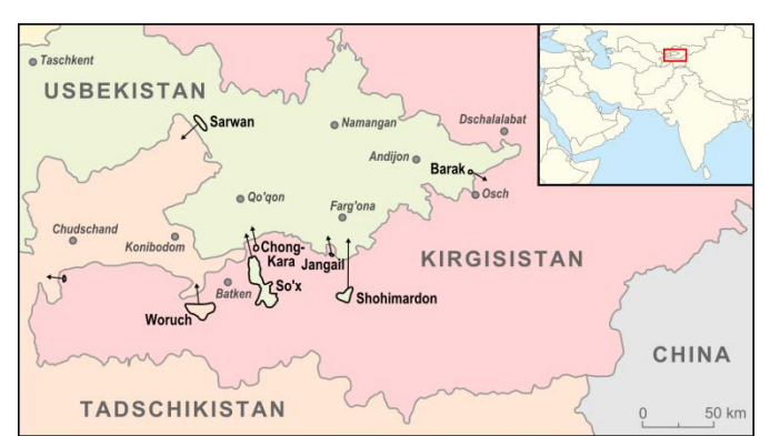
Figure 1: A map of the area of Kyrgyzstan and its neighboring nations. 1

Ever since then, Kyrgyzstan has remained (at least officially) a unitary presidential republic. Despite this, the nation itself hasn't been stable since independence. It undergoes ethnic