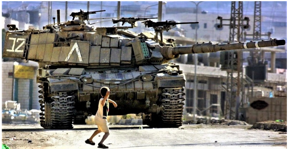
Figure 5: Israeli tank on patrol somewhere in the Gaza strip, attacked by rock yielding Palestinian child, second Intifada

Events reminiscent of the first Intifada soon followed and further tensions kept on rising, until October 12 th , 2000, when two patrolling Israeli soldiers accidentally entered Ramallah, a Palestinian residential area. The soldiers were arrested by local Palestinian police and rumours quickly spread, resulting in a large crowd numbering over 1000 people