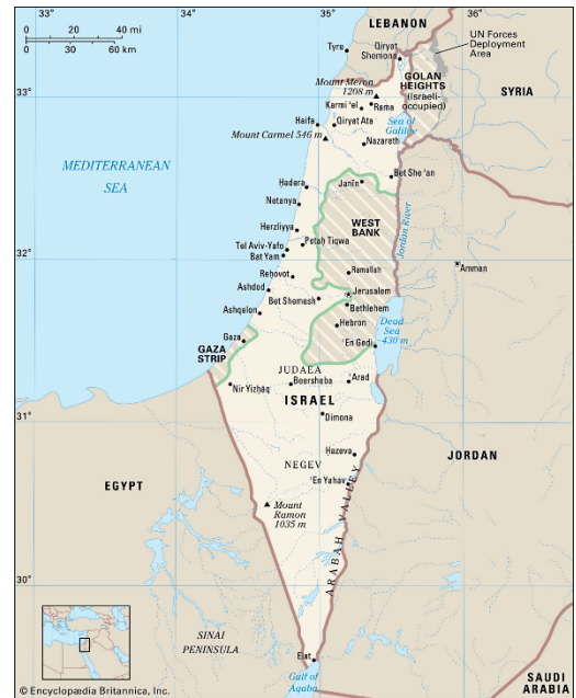
Figure 10: The two-state solution, as originally imagined in 1947

Shifting demographics have proved that the original two-state solution as we know it can now be considered obsolete. If the Palestinian state is to be created and to coexist with the state of Israel, then new plans on the assignment of territory need to be forged. The best organisation to carry out mapping and surveys, so that these new plans can be forged, would be a United Nations Security Council Special Committee, which would be named United Nations Special Committee on redistribution of Territory in Palestine. A new map, based upon local population groups and historical heritage, and agreed upon by all delegations and parties involved, could certainly help advance the cause of peace and prosperity.