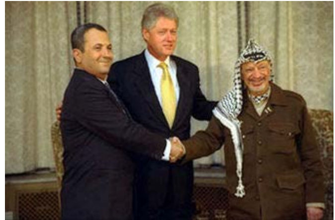
Figure 9: US President Bill Clinton (middle), Israeli PM Ehud Barak and PNA Chairman Yasser Arafat shake hands at the White House, July 2000

It is therefore the Security Council's duty to ensure that a new round of peace talks, correctly and fairly moderated, will succeed.