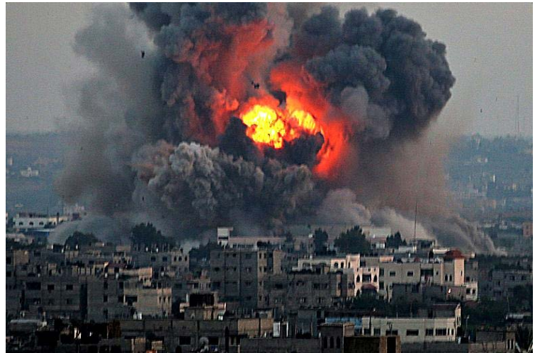
Figure 6: Rocket Production facility is hit by an Israeli howitzer, December 2008

IDF forces were ordered to invade the Gaza strip in 2008, in order to obstruct the carrying out of further destructive mortar and rocket attacks on Israel by Hamas extremists. Israeli planes carried out pre-invasion bombing on December 27 th 2008, before IDF land forces quickly swept through the wrecked and ruined northern Gaza urban areas. Rocket launch and production sites were seized