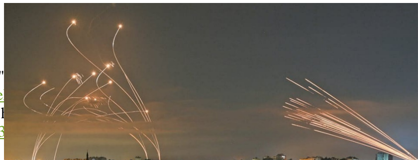
Figure 7: Iron Dome missiles are dispatched to intercept rockets