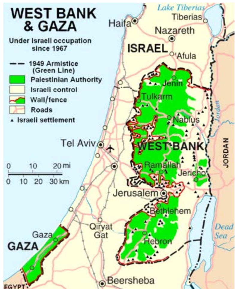
Figure 3: Map showing Palestinian land captured by Israeli forces, as well as the legitimacy of the PNA in these areas (marked in green)

A constantly growing Palestinian nationalist movement sprung up in Gaza during the late 70s. High birth rates, the Palestinian Exodus and Israeli segregationist policies kept the development index of the area well below that of Israel, which only resulted in further dislike – to put it lightly - of the Israelis. Israeli settlers had moved into the Gaza strip and taken over the few resource- and agriculturally rich areas there were, starving the Palestinian residents of sources of wealth and food. On top of that, unwarranted house searches, beatings, shootings, imprisonments and mock trials carried out by Israeli authorities in an attempt to curb Palestinian nationalism only worsened the already tense atmosphere.