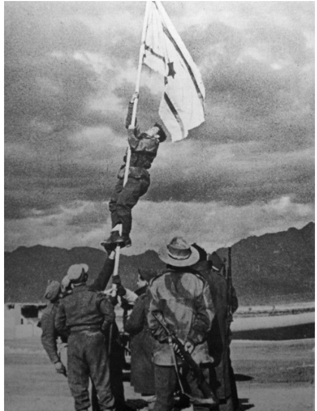
Figure 2: The Israeli flag is raised in Eilat, Israel's southernmost city

After the war's end, Israel sought to repair relations with its fellow Middle Eastern states. As such, a series of agreements between members of the Arab League and Israel were signed, under the supervision of the United Nations.