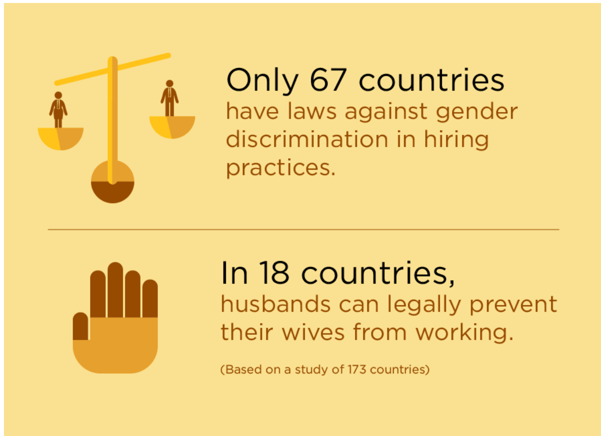
Figure 4: Legal barriers 19

place in 67 countries.” 18 Therefore, once again it is clear that women are discouraged due to the absence of legal support.