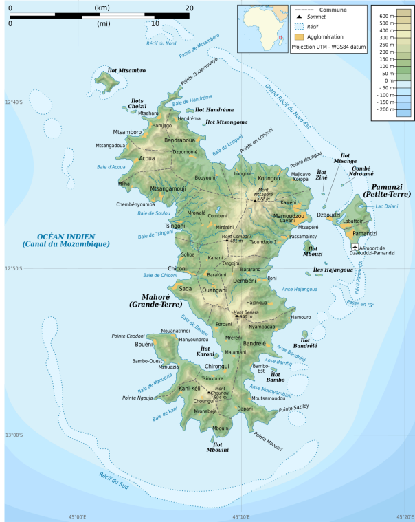
Figure 1: Map of Mayotte 1