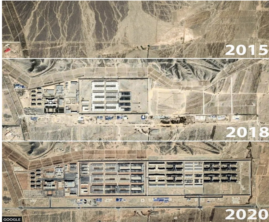
Figure 2: Satellite images show rapid construction of camps in Xinjiang, like this one near Dabancheng 32

Most people detained in the reeducation camps were never charged with crimes and had no legal avenues to challenge their detentions. The detainees seem to have been targeted for a variety of reasons, often due to their religious beliefs. Information on what happened in the camps remains limited, but many detainees who have since fled China described harsh conditions. 33