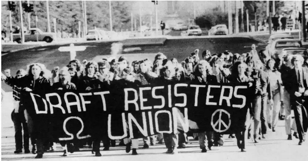
Fig. 3: Australians protesting against the government's decision for conscription 28