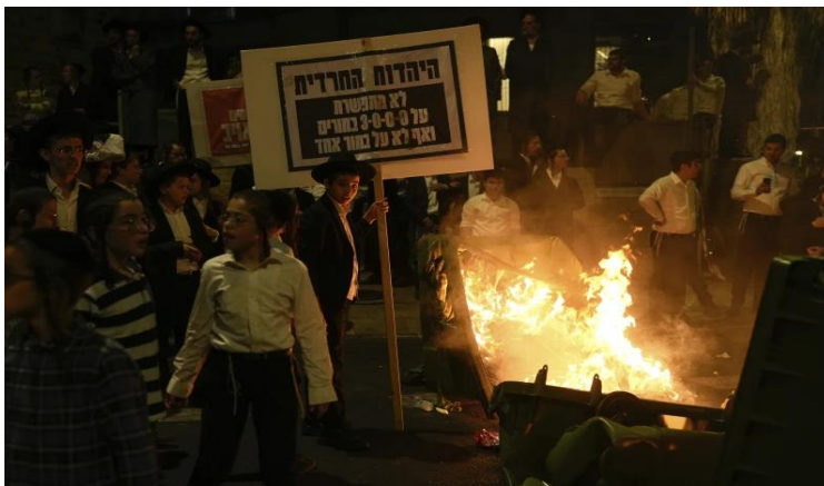
Figure 2: Israeli orthodox protesting after the court's decision for enlistment 17

The concept of the draft has caused resentment as over 600 soldiers have been killed in fighting, and tens of thousands of reservists have been activated, upending careers, businesses and lives.