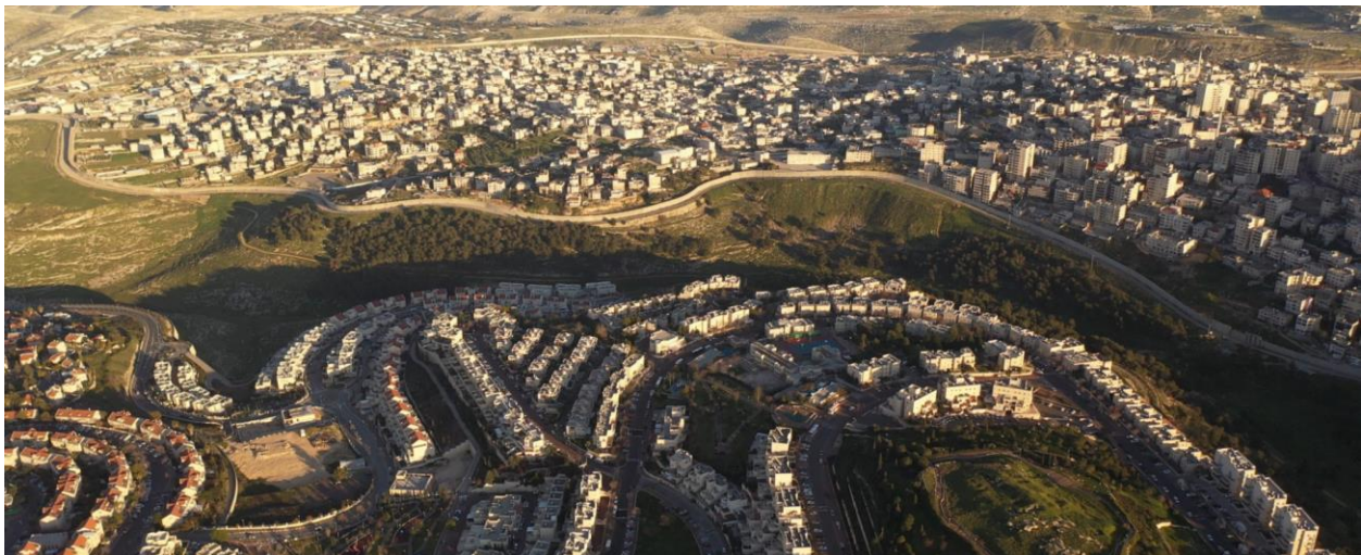
Figure 1 The security barrier dividing the Jewish neighborhood of Pisgat Ze’ev in East Jerusalem from Anata in the West Bank

The ministry of housing, in August 2021 presented a 9,000 housing unit settlement plan with the purpose of expanding the Atarot neighborhood, which is located between the Palestinian neighborhoods of Kfar Aqab, Qalandia and A-Ram south of Ramallah. It was mentioned that this plan would be discussed in a meeting in December 2021 in a meeting held with the Jerusalem District Planning and Building Committee. Nonetheless, on 24 November