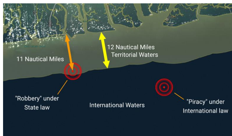
Figure 1: A visualization of the legal parameters of piracy 5

Earlier, among the definitions provided, there was a broad definition included. However it is worth pointing out that finding one uniform definition for “maritime piracy” is quite a challenge, seeing as definitions of maritime piracy are subject to conventions and there are a lot of different ones out there focusing on various legal aspects, some of which have been repeatedly disputed. Some contend that the lack of a universal concept of piracy is one very significant impediment to eradicating the global issue of maritime piracy. Their primary worry is that without a standardized definition, it would be impossible to devise structural and international responses. On the other hand, there have even been whole papers published arguing against one uniform classification of the phenomenon.