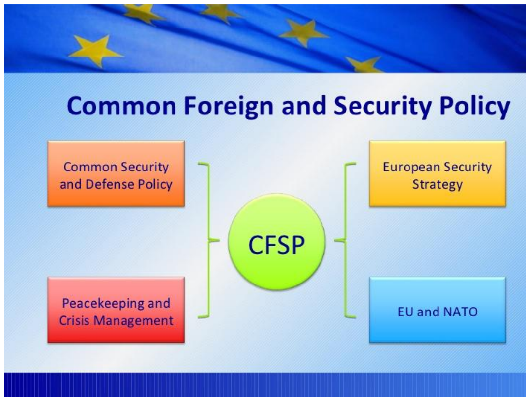
FIGURE 2: TASKS OF THE EU'S COMMON FOREIGN AND SECURITY POLICY (CFSP)

According to the Treaty on European Union, "the Common Foreign and Security Policy encompasses all areas of foreign and security policy. The civilian and military assets and capabilities of Common Security and Defense Policy are at its disposal. Common foreign and security policy is often concerned with preventing and dealing with crises as well as post-conflict peace-building." 4