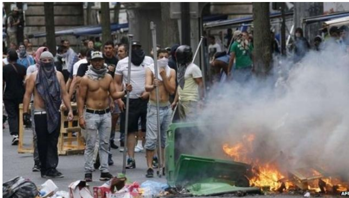
Image showing protesters clash with the police forces in France, 2014.

conflicts. In 2014, protests were banned in France over Israel's actions regarding the Gaza strip. Pro- Palestinians demonstrators took to the streets despite the ban and the situation turned violent. A similar event took place in 2019 in Hong Kong where once again demonstrations had been banned.