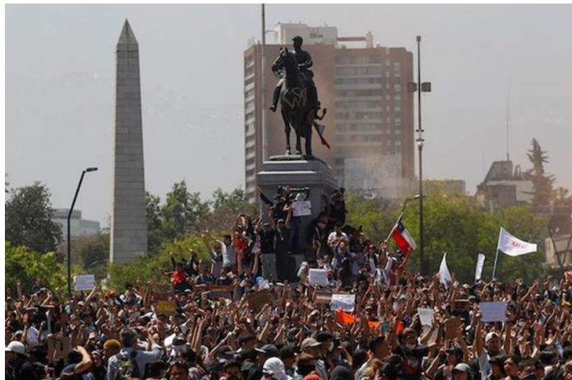
Protesters show flags and banners

such as freedom of assembly, are shunned, while there are many issues with trade unions not being allowed to form or protest. Chile has further experienced forced labor of foreign citizens in the agricultural, domestic and mining sectors 6 , whilst the government has idly stood by. This is because the current conflict has drawn the government's attention away from such issues and has led to further limitations of civil liberties, such as the freedom of speech.