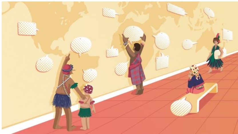
Cartoon portraying the linguistic diversity worldwide.

history of thousands of years, whether they are widely spoken or not 2 . This is the reason why many nations are taking action to reverse this dangerous process. With methods, such as language documentation, governments can monitor the existence of lesser known or spoken languages and actually start working towards halting this devastating development. Apart from that, the United Nations and, more specifically, UNESCO have made further