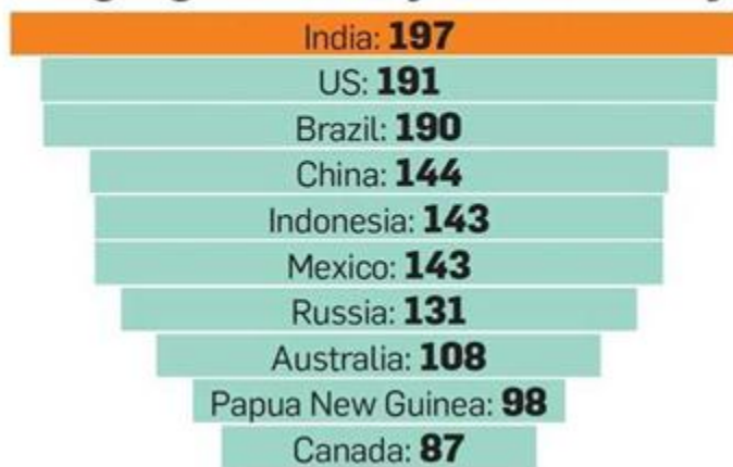
Chart showing that India has the largest number of endangered languages.

With 197 endangered languages, India occupies the first place in the world in front of the US (191), Brazil (190) and China (144). The Indian government has acted via many governmentally funded initiatives that help preserve these languages. The purpose of the above-mentioned initiatives is to document, archive, and further study any lesser known languages or those that are currently endangered or will possibly be endangered in the future. Lastly, the Indian government also provides funding to universities for researching and studying indigenous and endangered languages in the country.