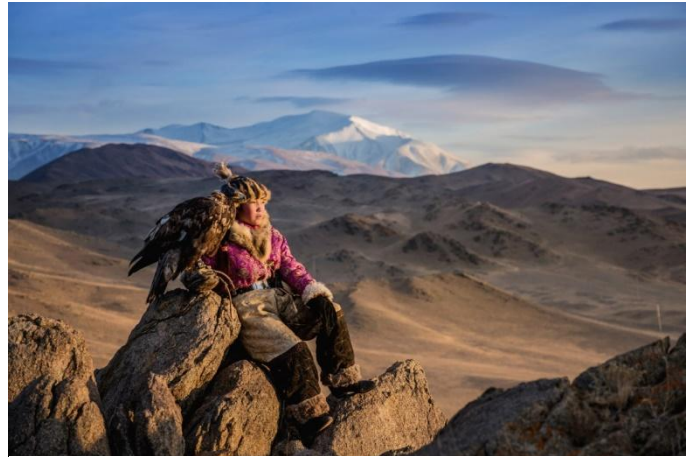
One of the few speakers of the Mongolian languages which are among the most endangered languages worldwide.

Because of the plethora of languages worldwide, the causes to become endangered significantly vary. There are four stages of endangerment, after which a language can become extinct with little to no chances of being “revived”. A typical example is the Tasmanian languages and dialects that became extinct during the 19th century. The same phenomenon took place in the Alaskan communities of Yupik Eskimos when their native language abruptly became extinct. Approximately 22 years ago the Yupik language was spoken by children. Today, however, the new generations of Yupik Eskimos in the area speak only English. A last example of the gradual endangerment of a language is the following: