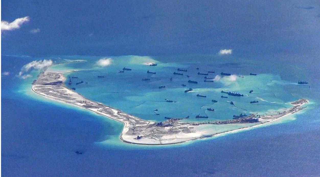
(Subi Reef being built by the PRC and transformed into an artificial island, May 2015)

back into the ocean. These parts of land, due to all the chemicals and the cement used for their construction, could eventually harm the ecosystems around them.