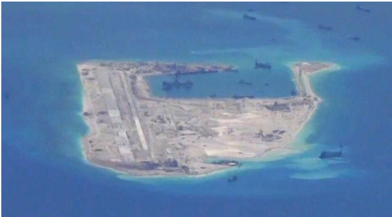
(Fiery Cross Reef being transformed by the PRC in May 2015)