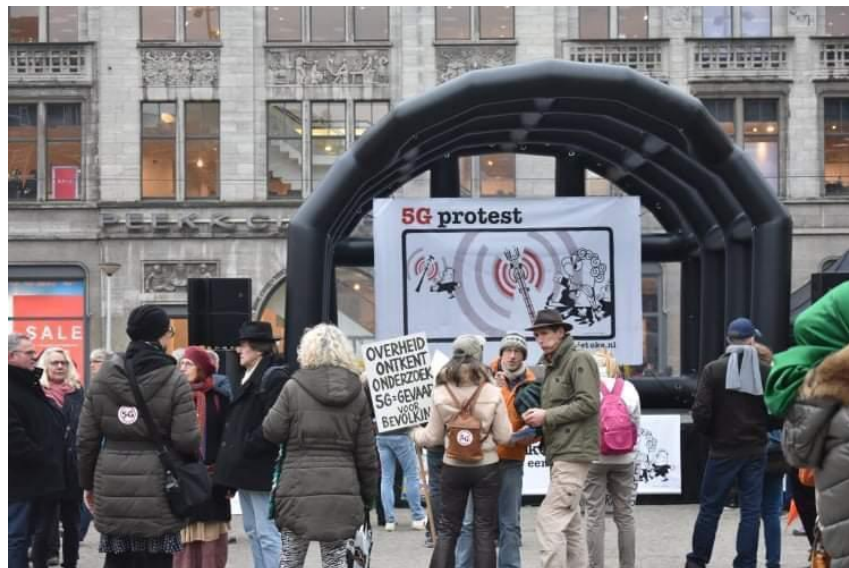
Figure 3 depicts a 5G protest that took place in Amsterdam, Netherlands regarding the alleged health issues that can occur when this connection is used 6

It should be mentioned that the Chinese company Huawei faced many difficulties throughout the escalation of the trade war between the U.S. and China, bearing the strict regulations the Trump Administration imposed in mind, which focused on banning all companies (including Huawei) from utilizing information and communications technology from any party considered a national security threat. The United States of America further moved to adding the company to the "Entity List", which is to be considered as a black-list. Although the One Trade Deal agreement between these two parties managed to de-escalate the issue and provide solutions to it, the U.S.'s pressure on the company remained stable, which has caused tensions within the technological industry.