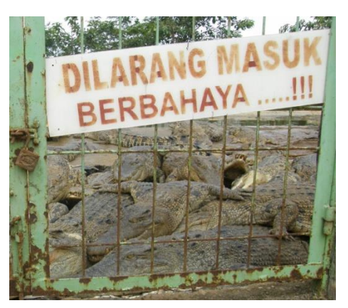
2 Crocodile farm in Indonesia

Crocodiles in particular, have to deal with such issues. Investigators in crocodile farms in Vietnam have uncovered thousands of crocodiles living in concrete enclosures sometimes smaller than their own bodies for up to 15 months in a completely lethargic state before they are killed. In similar farms in the area they are thrown into concrete pits which are so cramped that as expected the crocodiles get aggressive and injure each other which due to lack of medical care leads to infections.