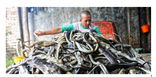
4 Pile of dead snakes in Indonesian slaughterhouse

There is a false belief that snakeskin is best when peeled off an alive snake.