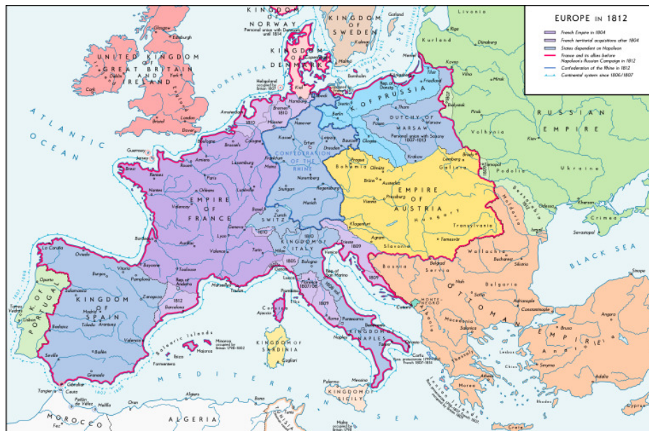
Fig.3: French claims during the Napoleonic Wars

A balance of power can exist on a global or on a regional scale, depending on which system is taken as the “field of research” each time. A regional balance of power (e.g. the Asia-Pacific balance of power) is highly dependent not only on the states of the region, but also on hegemonic countries not located in the region, should there be any.