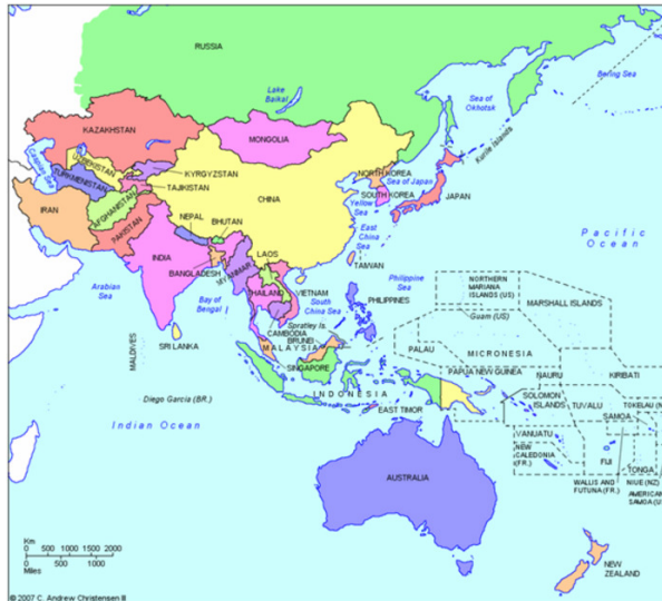
Fig.4: The Asia-Pacific region