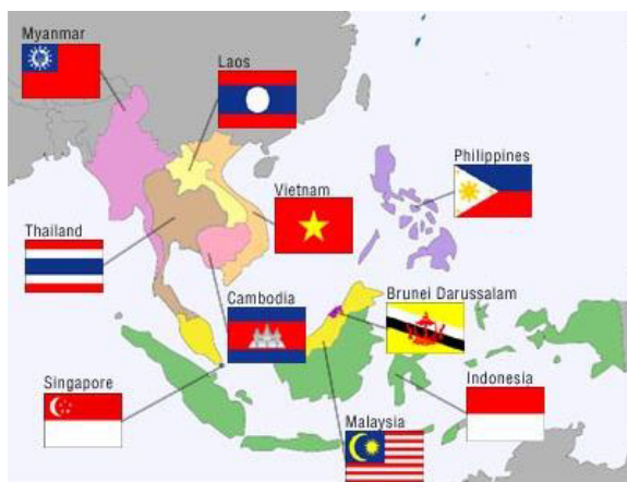
Fig.6: Map of the ASEAN countries

Since 1992, there is also a trade bloc agreement linked to the Association, called AFTA (ASEAN Free Trade Area), attracting more investors and enabling the developing states to bloom. In 1997 ASEAN underwent the extension of itself by the addition of China, Japan and the Republic of Korea in the so-called ASEAN+3. Since then, ASEAN and ASEAN+3 coexist and ensure the benign relations of the Eastern nations. Relevant to ASEAN is the Regional Comprehensive Economic Partnership (RCEP) as well, an organisation for better negotiations between the 10 ASEAN States and the 6 Countries with which ASEAN has trade agreements (Australia, China, India, Japan, New Zealand, Republic of Korea).