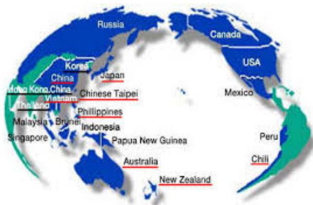
Fig.5: APEC Member States

Acting for its members’ economic and sustainable development, APEC was established in 1989 as the idea of a former Australian prime minister. It has 21 Member States, committees with varied purposes and annual leaders’ meetings. 40% of global population and 57% of global economic performance is represented in APEC.