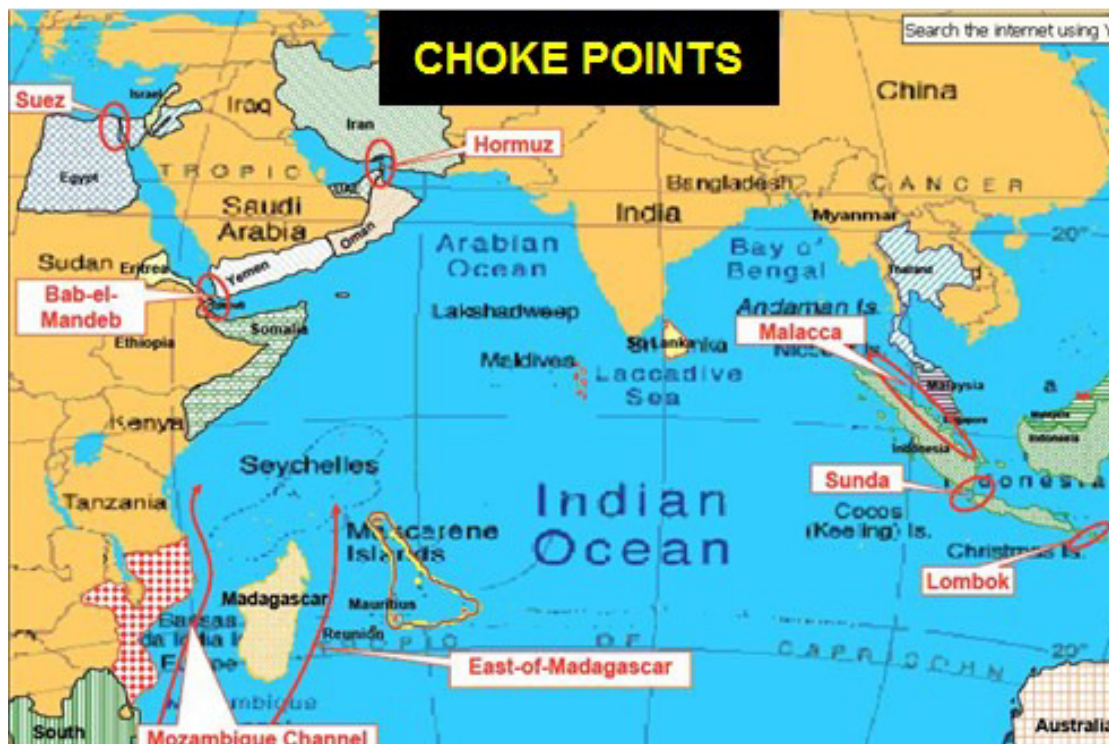
Fig.7: SLOCs of the Indian Ocean

Maintaining the security of these SLOCs is a priority for the Asia-Pacific countries, as their economies, their energy supplies (transported to China, Japan and ROK from the Persian Gulf and West Asia) and their relations with the US would be undermined. However, it can be also affected by internal factors of the region, such as ill political relations and territorial and maritime disputes, which are not rare due to the fact that the sovereignty over straits can yield vast profits (related is the South China Sea dispute). Security can be also breached by piracy and maritime terrorism. The latter one is advocated by the fact that South Asian states are home to radical Islamic groups and responsible for its prevention are the states having or claiming rights on the specific international waters. Generally, the issues related to SLOCs can be divided in two sub-categories: military ones (disputes, Chinese interventions in the South China Sea, etc) and non-military ones (oil spills, accidents, etc).