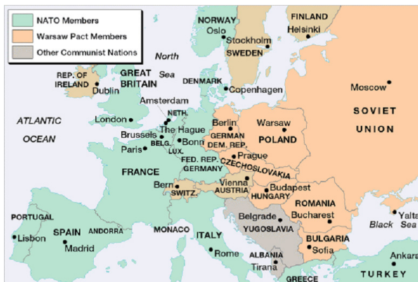
Fig.2: Division of Europe in the Cold War Era