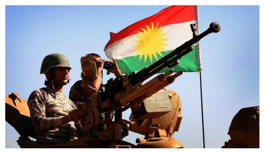
(The Peshmerga forces with the Kurdish flag as their emblem)