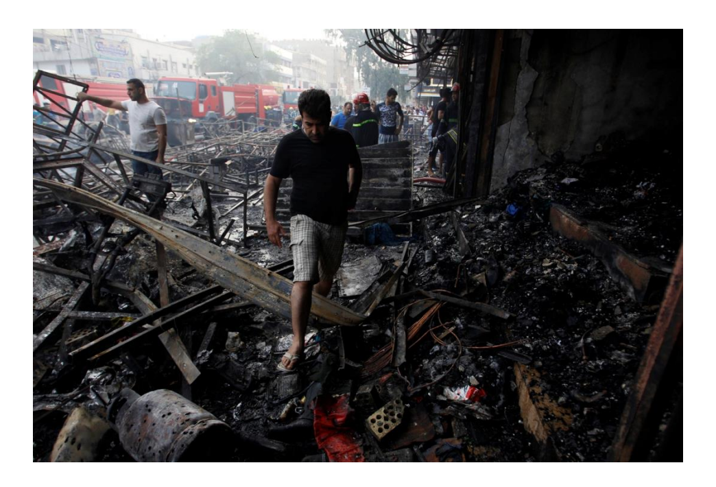
The Karrada shopping area in Baghdad, Iraq after a suicide car bomb killed more than 200 people